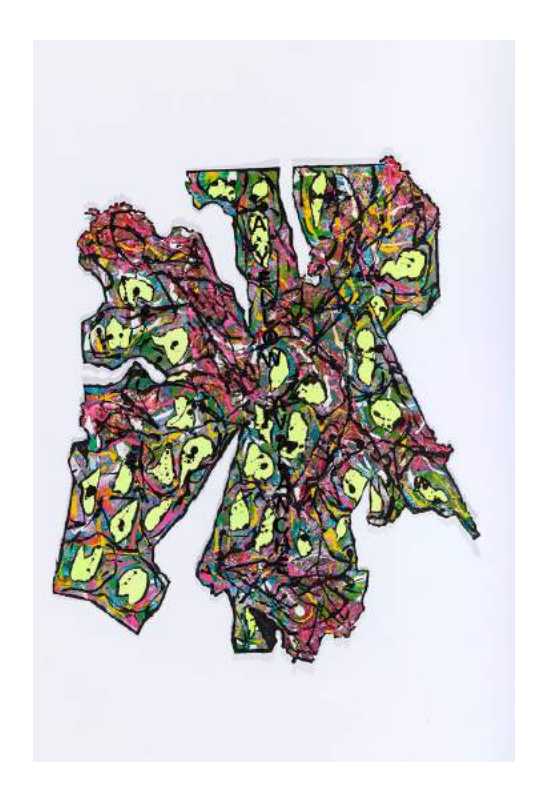
"A Yellow Avalanche" by Jo-Anne Bates, part of her upcoming exhibition EXPLORATION of COLOR (download)