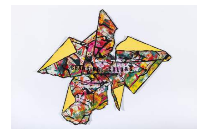
"Changing Colors" by Jo-Anne Bates, part of her upcoming exhibition EXPLORATION of COLOR (<u>download</u>)